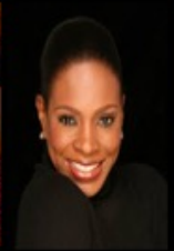
Sheryl Lee Ralph