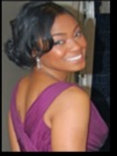
Tatyana M Ali